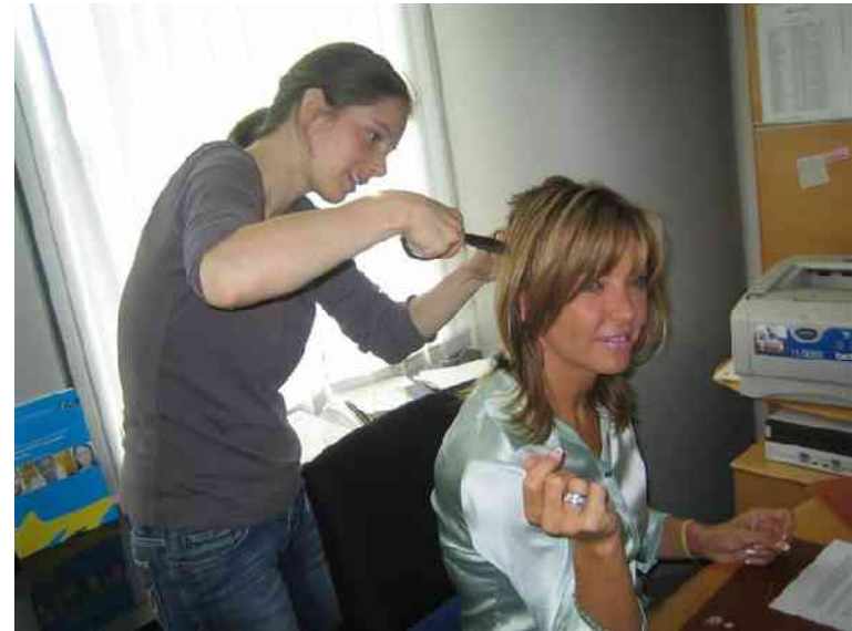
Photo of leading Euro Parliamentarian on Environment and Health, Frederique RIES